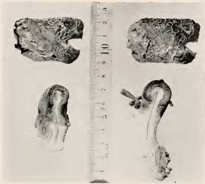
FIG. 1. Head and intromittent organ of G. berlandieri (left) and of G. agassizi .

Note the near equality of head size of two mature males of substantially different body size (carapace of G. berlandieri 176 mm. long; that of G. agassizi 220 mm. long). The single intromittent organs differ principally in pigmentation.